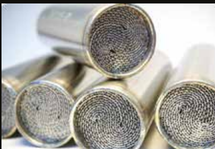
Honeycomb cylinders, the core of the Falkenhagen reactor

project, 'Innovative Large Scale Energy STORagE Technologies & Power-to-Gas Concepts after Optimisation' (STORE&GO), involves the demonstration of three different PtG concepts in: Falkenhagen, Germany; Solothurn, Switzerland; and Troia, Italy. The work builds on previous research that has demonstrated the technical feasibility of PtG technologies, and seeks to further enhance the technology's ability in order that it can be integrated into the daily operation of European energy grids.